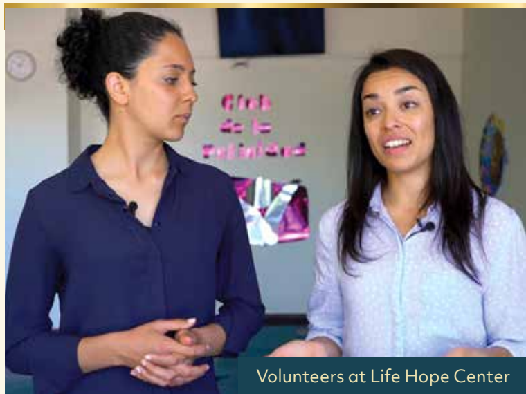
Volunteers at Life Hope Center