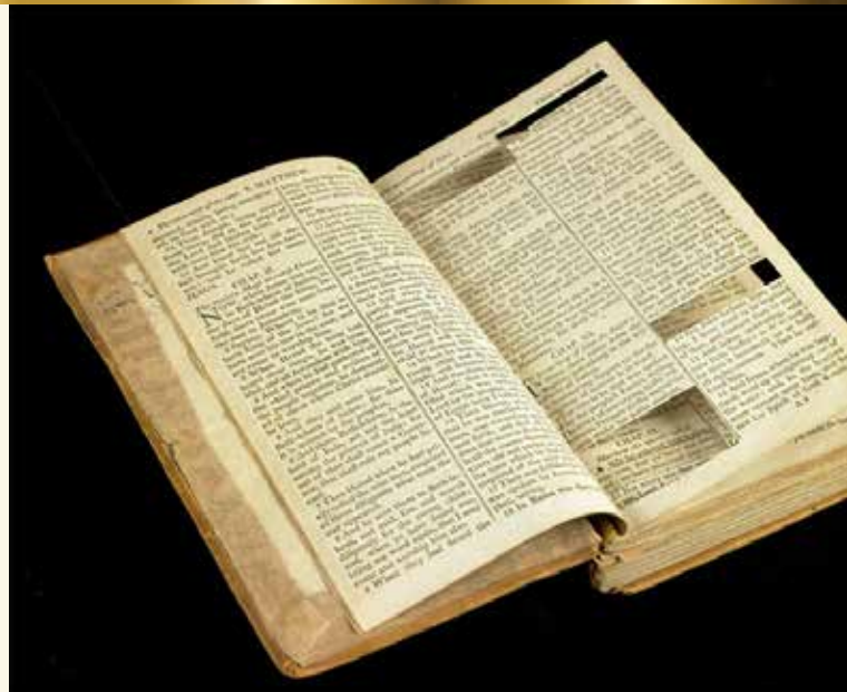
Thomas Jefferson cut the references to the miracles of Jesus out of his Bible creating a Bible that suited him.

question we must ask ourselves is whether we should interpret Scripture on its own terms or whether we should superimpose our ideas or methods on the biblical text.