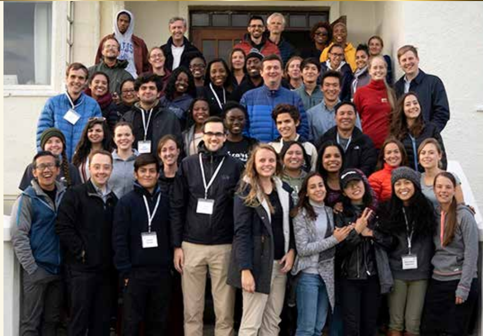
Fifty missionaries from six continents spent 10 days in Iceland, one of the most secular countries in the world. Their goal: to reach the entire nation through the power of prayer.

As we talked, our vision began to take shape. We would prayer walk Iceland’s capital region of Reykjavik and surrounding cities where 65 percent of the country’s