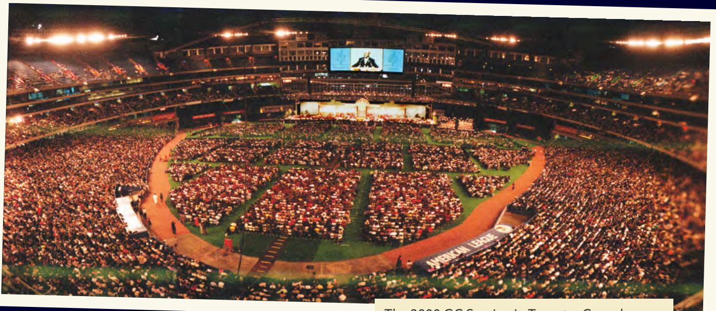
The 2000 GC Session in Toronto, Canada, was the first to vote a resolution on the Bible.

Some kind of resolution or statement on the Spirit of Prophecy dates back to 1946 (recognizing that more specific resolutions about the EGW writings were not uncommon in the early days of small, annual sessions); and the resolution on the Bible dates back to 2000.