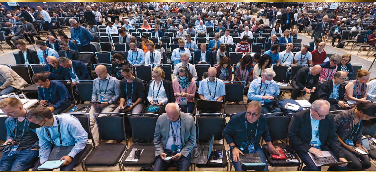
Delegates to the 2022 General Conference Session use their computers and phones to vote.